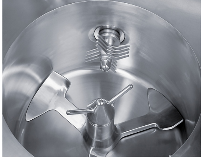
Sample MGT installation with various options