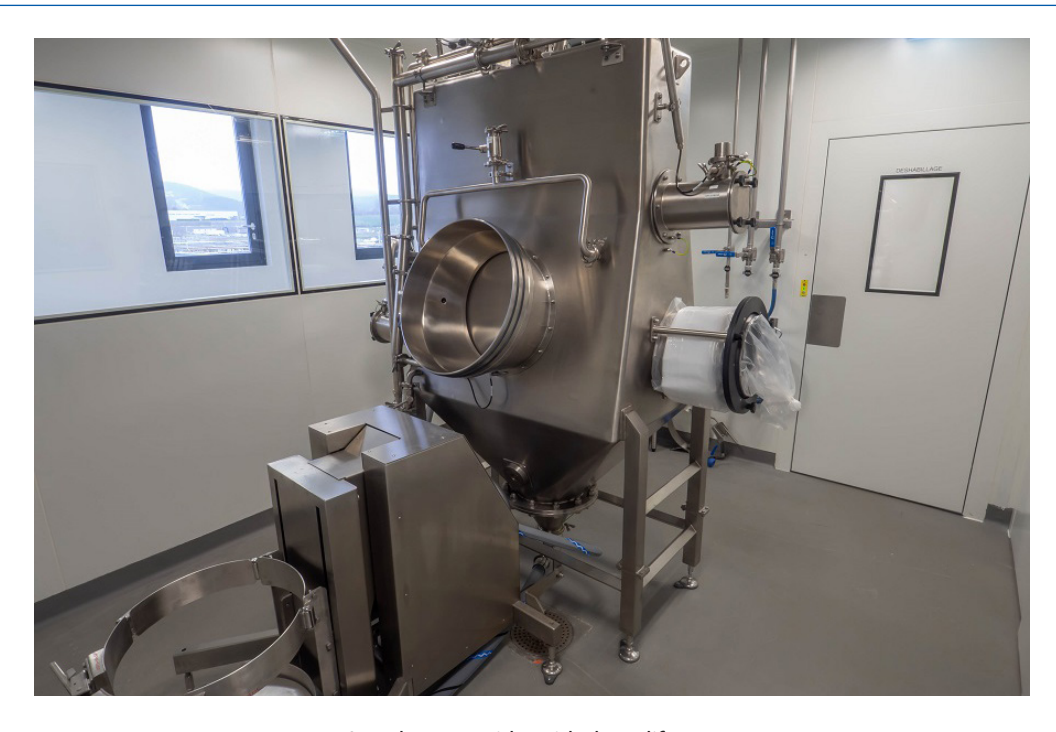
Isotube - rear side, with drum lifter